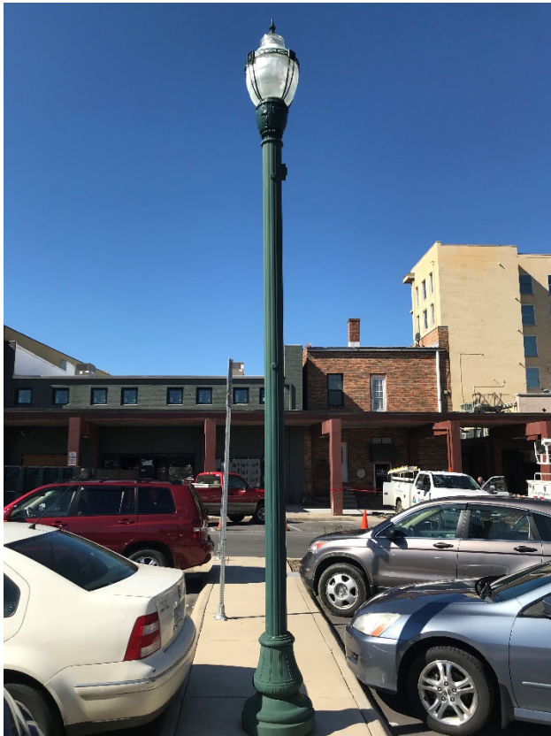
Fig. 6 Example of Cultural District Green Decorative Pole with Period Light