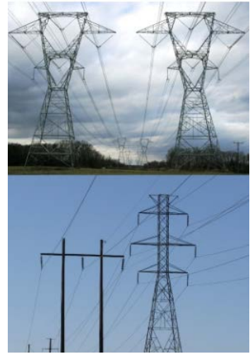
Fig. 2 Distribution Lines