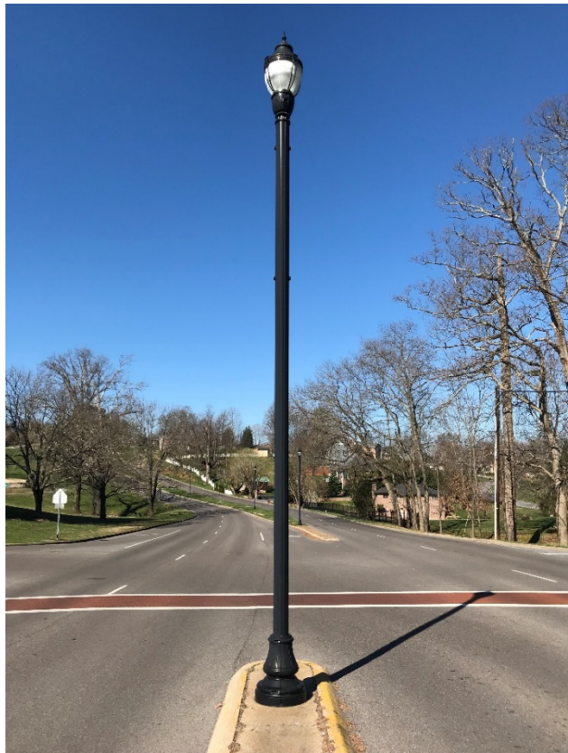
Fig 7 Example of Black Decorative Pole with Period Light