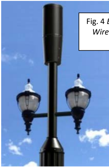
Fig. 4 Example of Period Light with Small Wireless Facility.